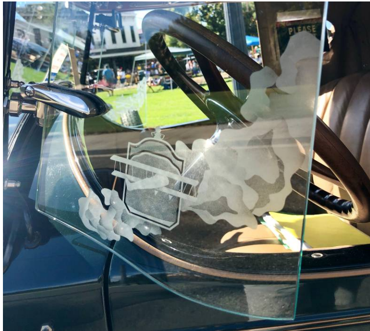
Beautiful stencil on the wind wing of a 1927 426 Six owned by PI members, the Koch family.