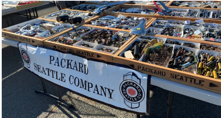
The Packard Seattle Company table at the swap meet was a treasure trove!

Leaving my home in San Jose, I paused to observe the clear blue sky and thought “what a beautiful day for a swap meet.” Having never been to the annual event at the World Classics Center in Vallejo, I didn’t know what to expect, but I was a man with a mission: I wanted to find parts for my newly acquired 1934 Packard 1100 Sedan.