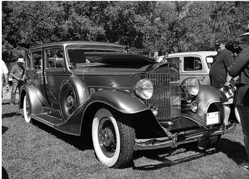
Jon Fuiks' '33 1003 sedan.