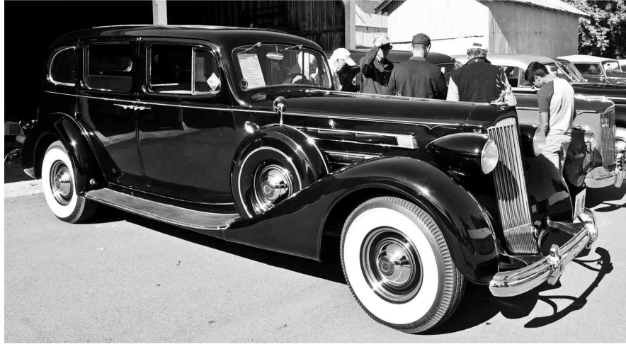
Bud Juneau's '37 V-12 1508 is named "Helen Twelvecylinders" after screen star Helen Twelvetrees.