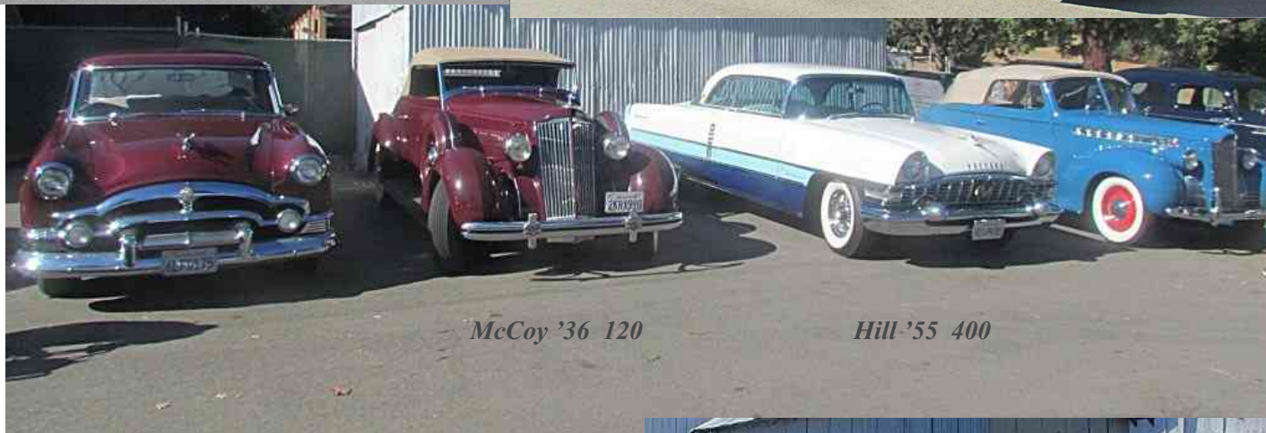
McCoy '36 120