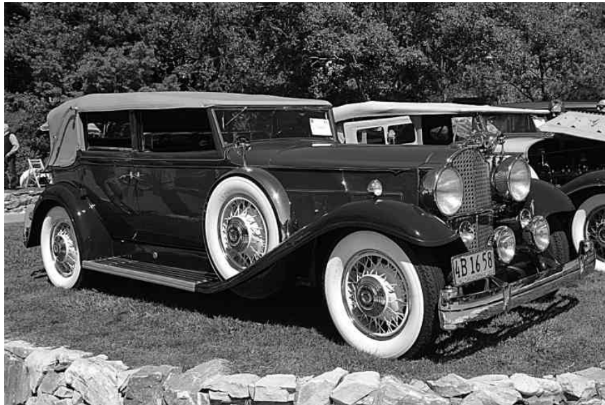
Clint Moore's '32 903 Dietrich convertible sedan.