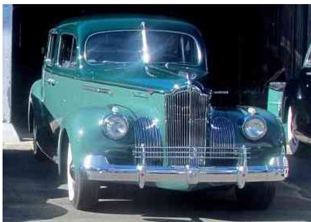
Morrison '41 120