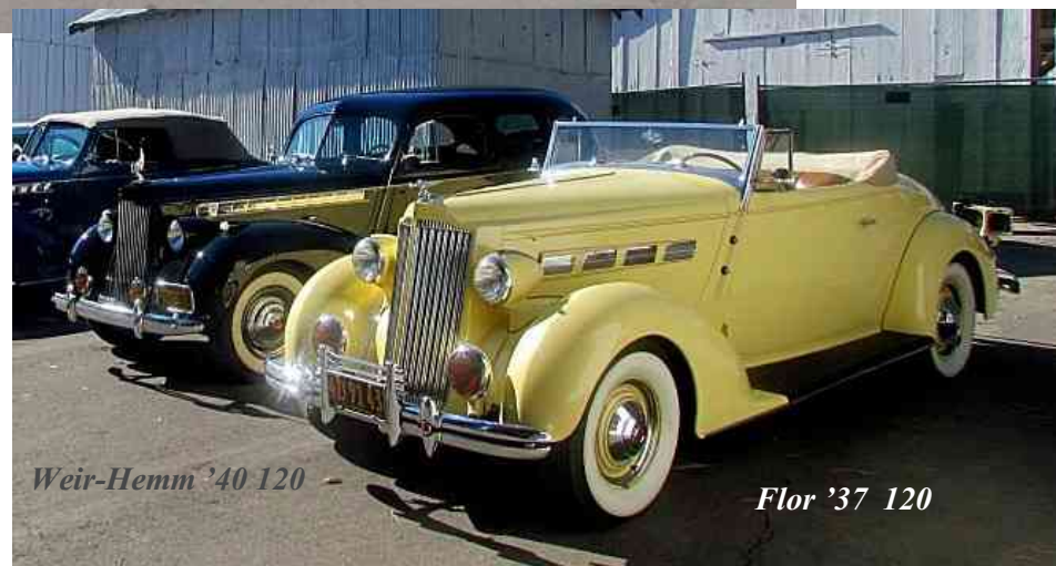
Weir-Hemm '40 120