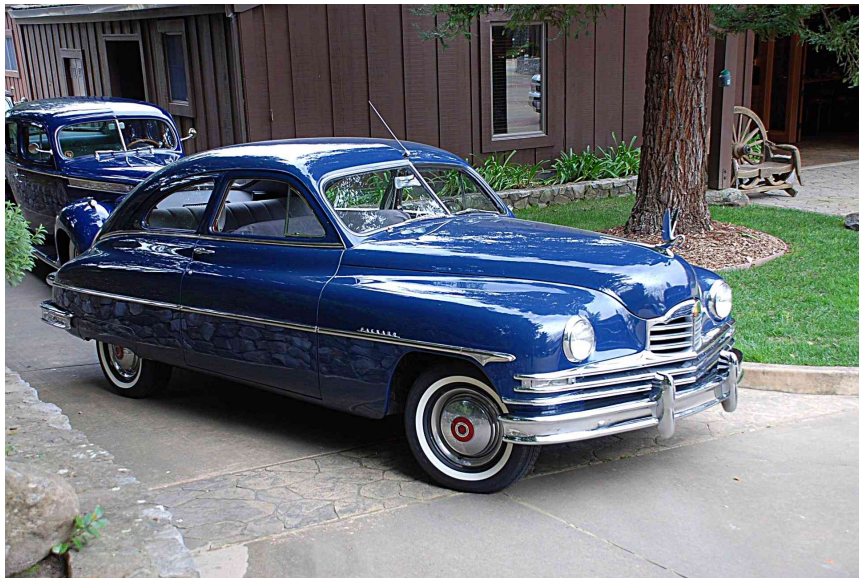
The Carpenter's '49 2301 club sedan.