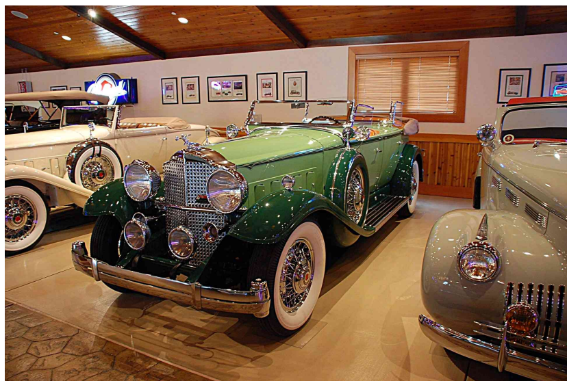
This '32 903 Eight De Luxe sport phaeton would be a perfect choice for an evening's drive on a warm summer night.