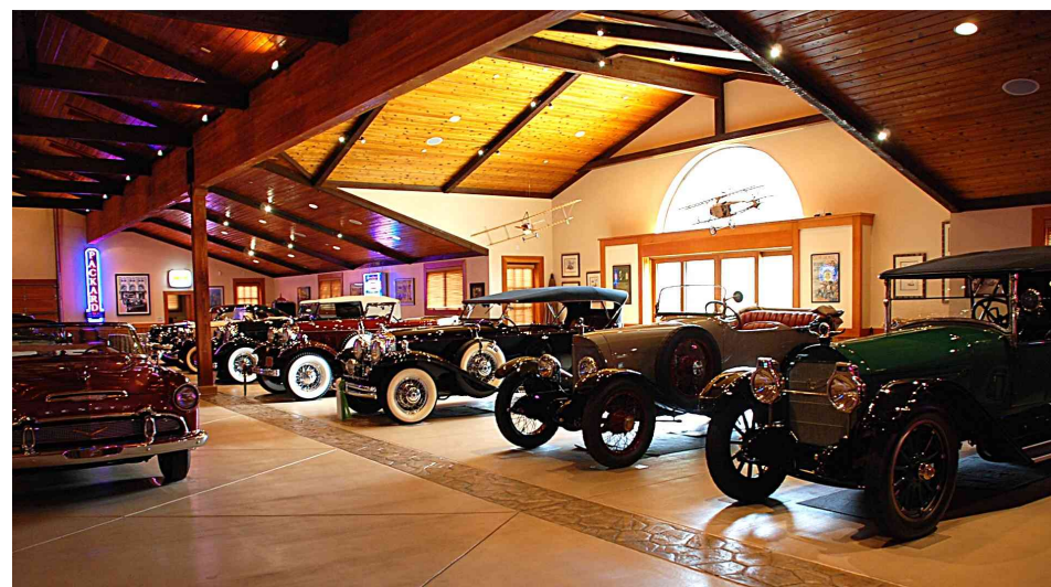
A neon Packard sign decorates the back wall of this display area that opens to a patio; perfect for circulation during an event..