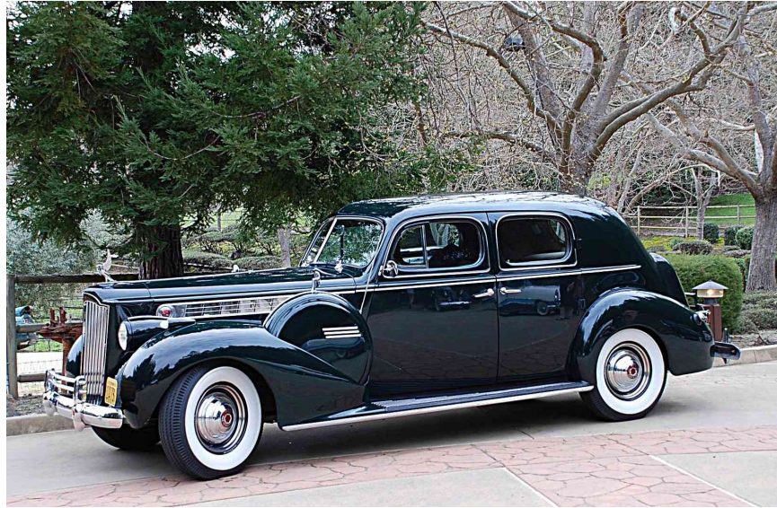
The Butterworth's '40 1806 club sedan.