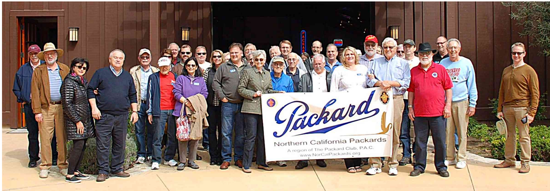
A fine looking group of Packard enthusiasts in front of one of the Carter's showroom buildings.