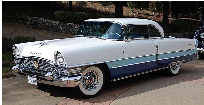
The Hill's '55 400 HT.

Carter collection photos continued after centerspread