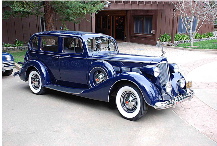
The Beck's '37 1500 touring sedan.