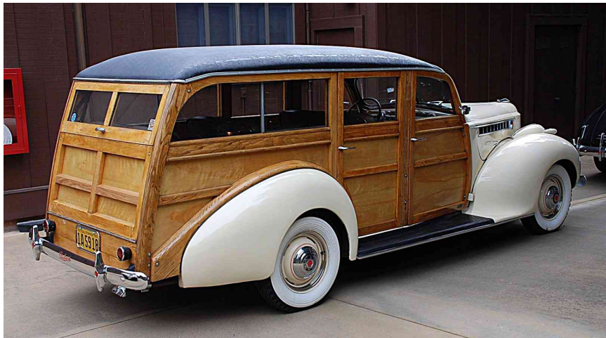
Bruce & Rhonda Cummings brought their rare (even though we have two in Nor-Cal) station wagon.