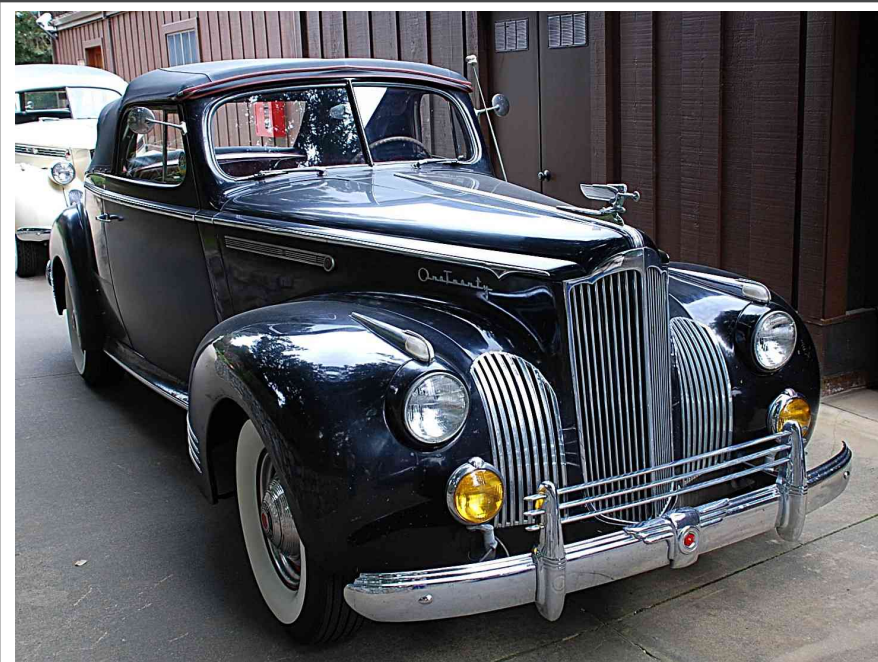
James Laughlin's '41 120 convertible coupe.