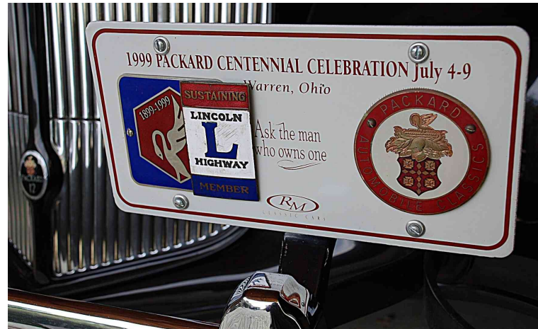
This Lincoln Highway membership badge is likely from 1913-14.