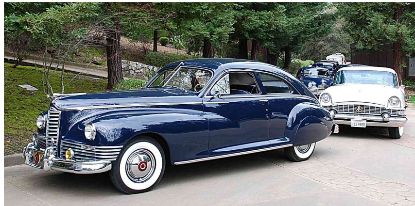
Our Packards were parked in the driveways between the buildings and made a nice display of their own. Here we see Henry Hopkins' latest acquisition - a beautiful '47 Custom Super Clipper club sedan. The car has many interesting accessories and is gorgeous.