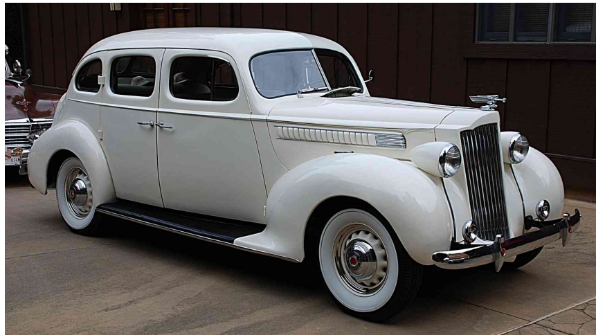
The Blazeks' '39 1700 sedan.