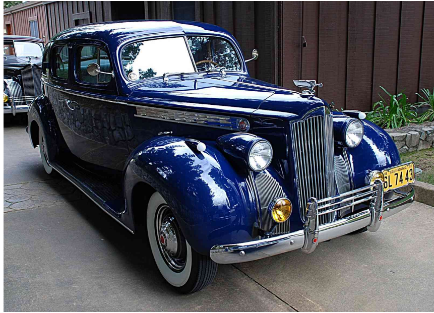
The Higgins' '40 1800 sedan.