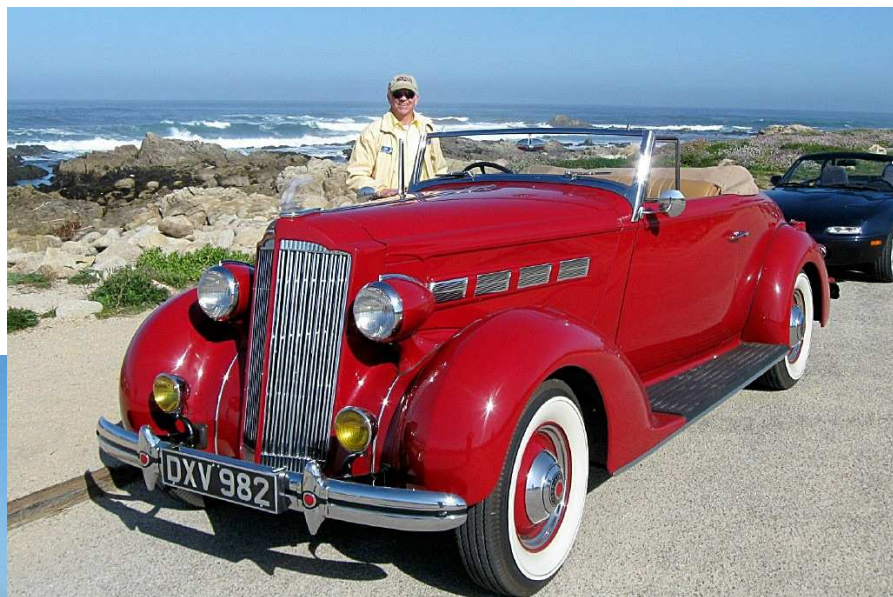
O'Connor '37 120