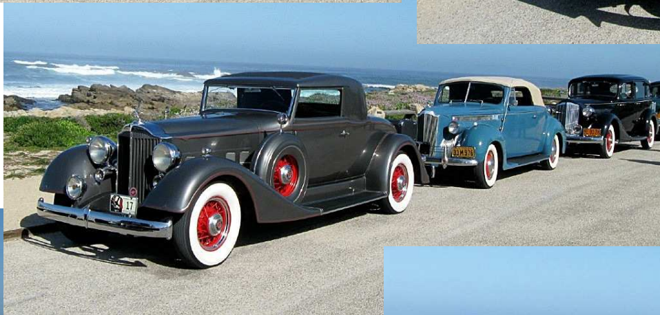
Wheeler '34 1101 Toland '40 110 Pava '36 1401