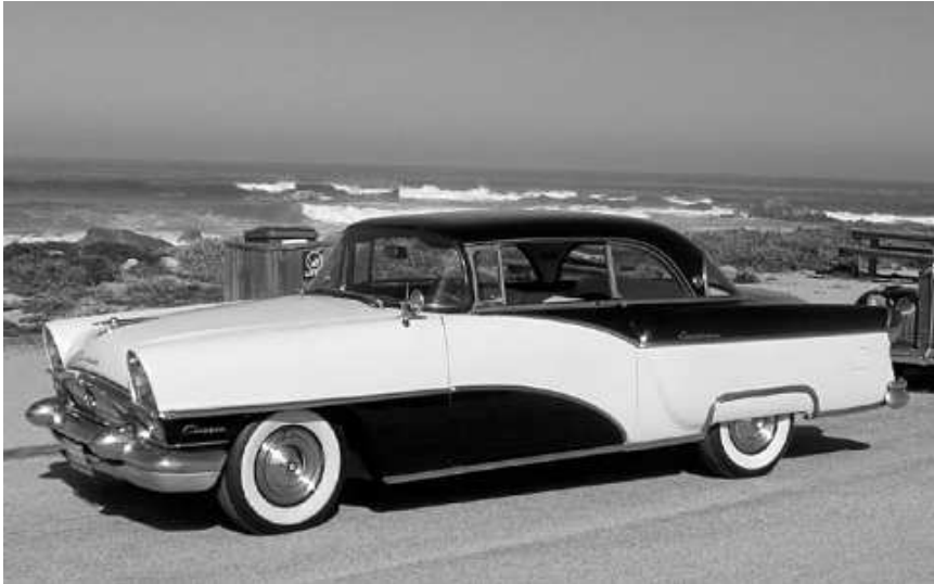
The Atherton's '55 Clipper Constellation Hardtop.

fifteen miles down Hwy 1 to the Rocky Point Restaurant. There we enjoyed a beautiful lunch with a marvelous view of the Pacific coastline.