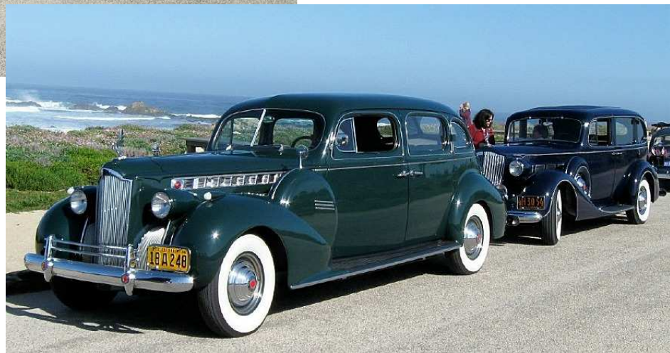
Barchas '40 160 & Beck '37 1500