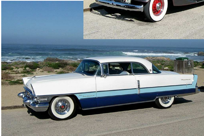
Hill '55 400 HT