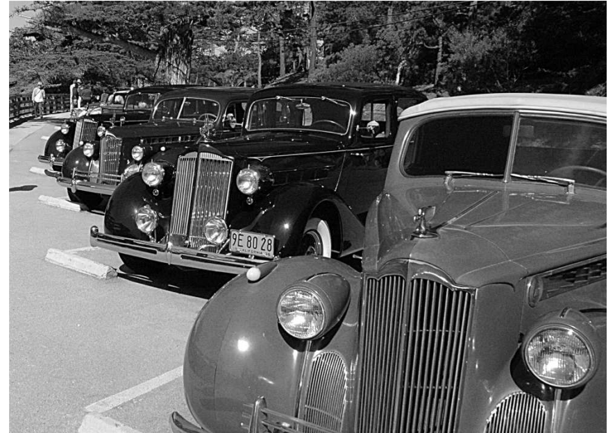
Toland, Pava, Barchas, & Beck.