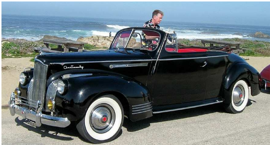
Laughlin '41 120