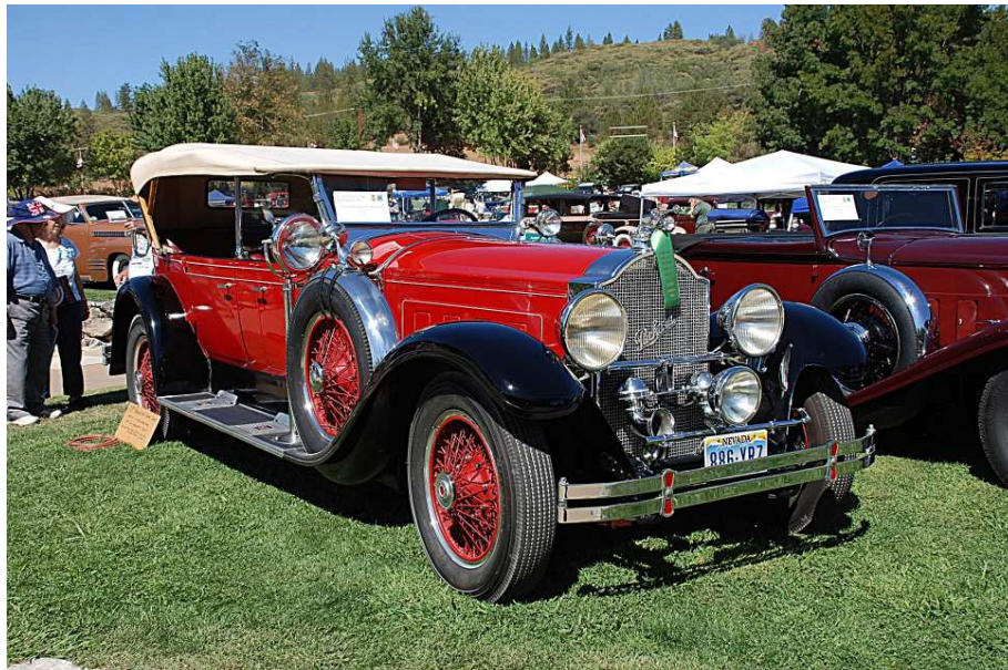
Ev & Gus Youngs' '29 640 phaeton