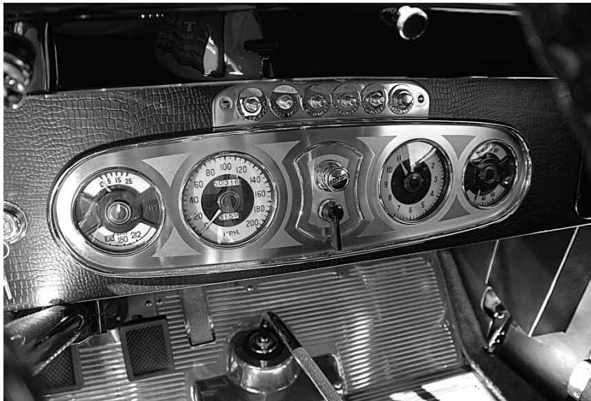
Stock instrument panel is set on a leather covered dashboard, various lights are controlled by switches above, and speedometer is KPH.