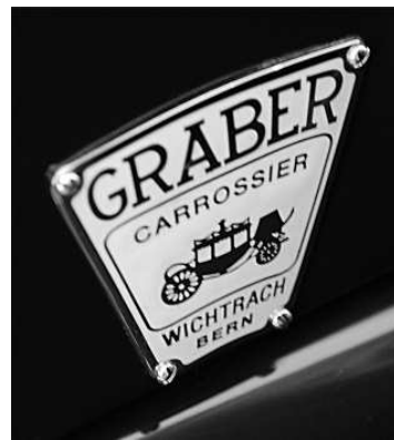
The Graber body plate.

It looks more like a '34 model, and has a very European appearance, with the sweeping fenders, large headlamps, and fine-mesh radiator screen. The wheels are chrome-disc style and Werner's name is prominently displayed on the radiator screen. The body is painted a dark olivine brown color with a black top.