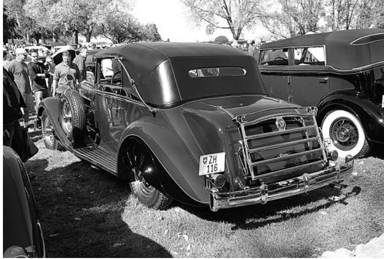
A typical Graber look from the rear, with leather top covering,, sweeping fenders, heavy landau irons, and a slit rear window.