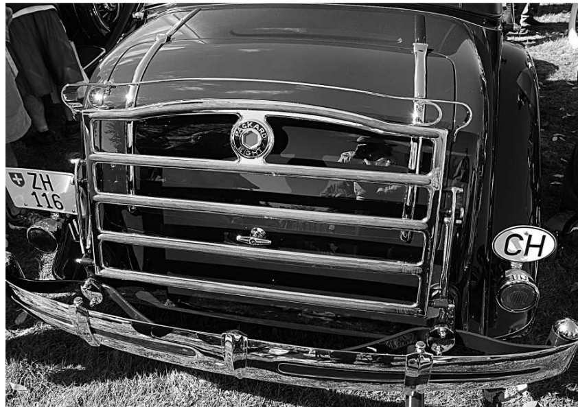
The strips on the luggage rack are made of wood. The rack has the accessory bumper.