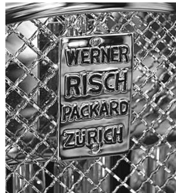
Name plate on the screen.