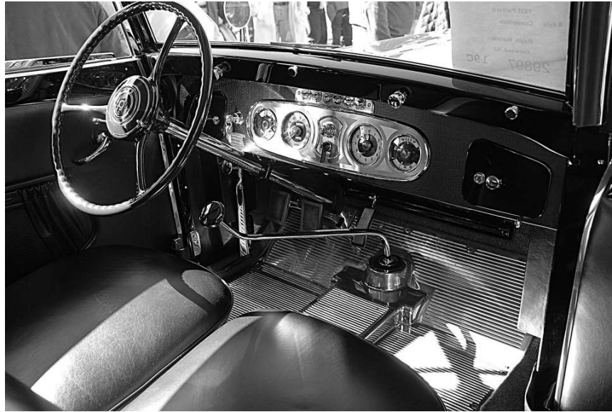
The cowl and floorboard are cast in aluminum as one unit. The long hood puts the seating further back, so the shift lever has to be curved back so the driver can reach it.