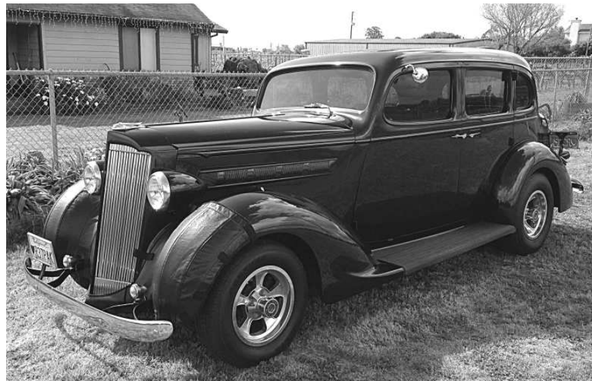
The Stephensons' '37 115 C.