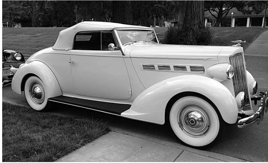
Chip & Denise Flors' '37 120.