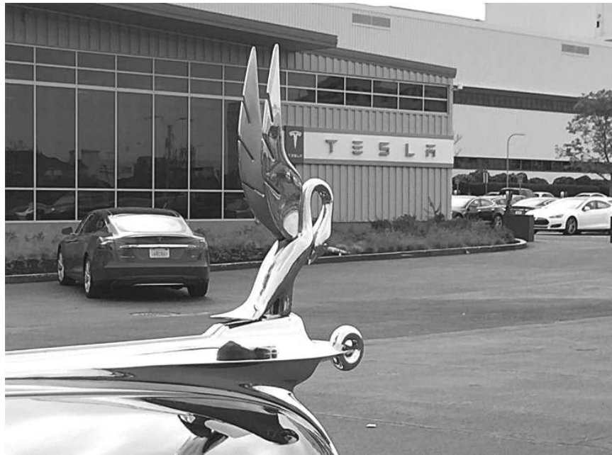
A Cormorant's-eye view of the Tesla visitor's center.