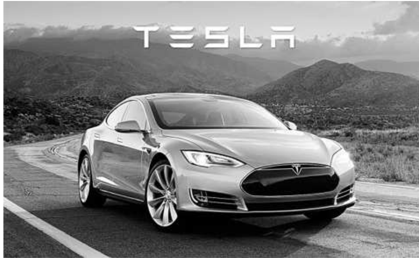
The Model S is the Tesla current production car.