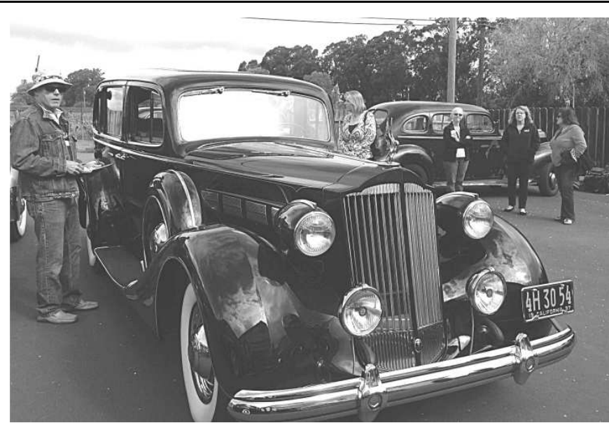
George & Eddie Becks' '37 Super Eight.