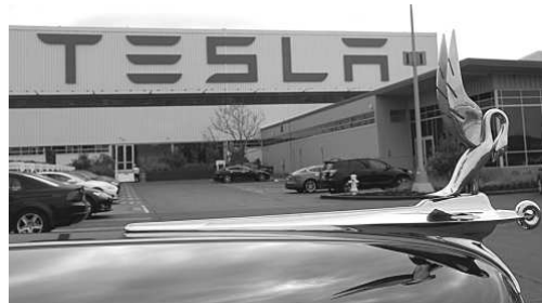
Tesla tour report starts on page 8