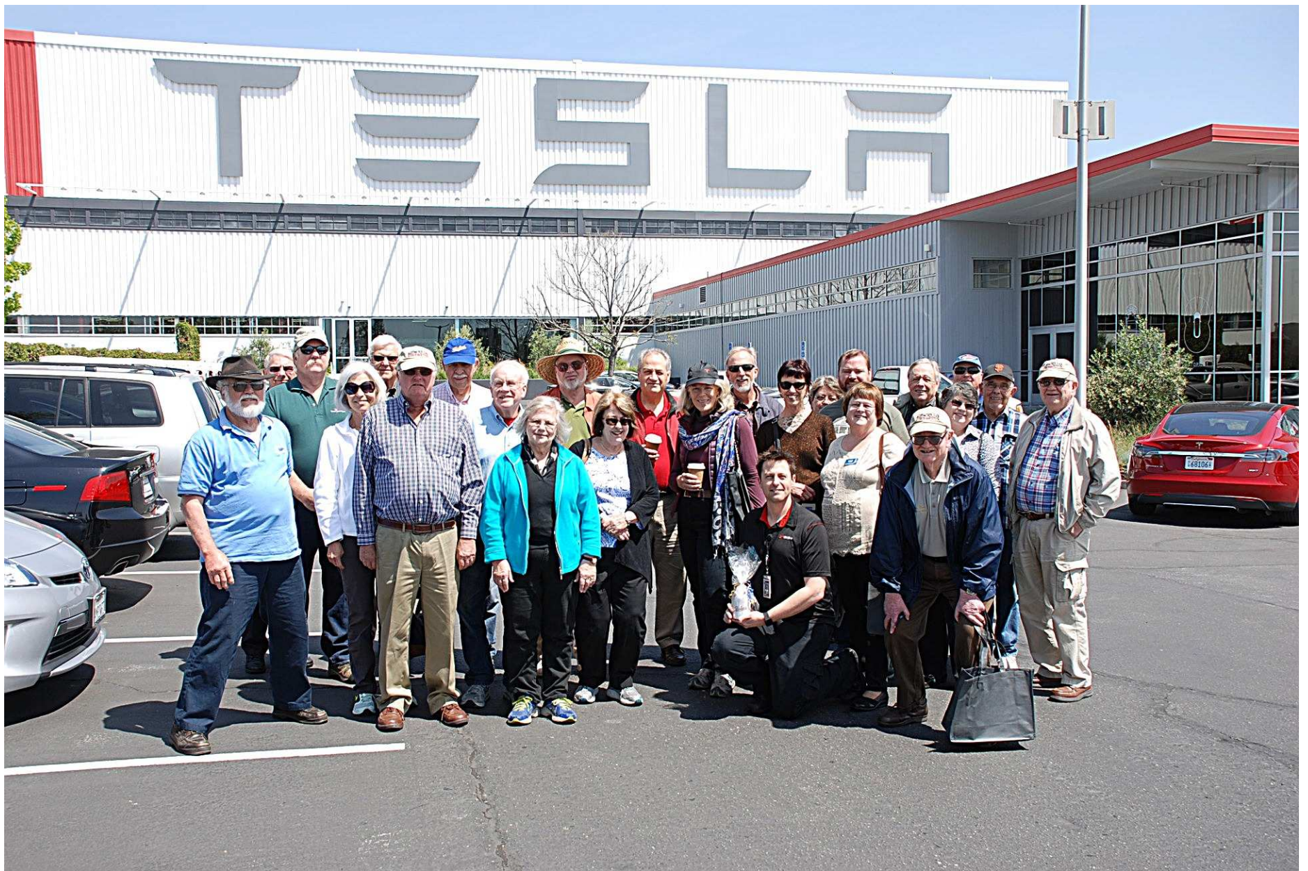
The tour group in front of the main Tesla factory building.