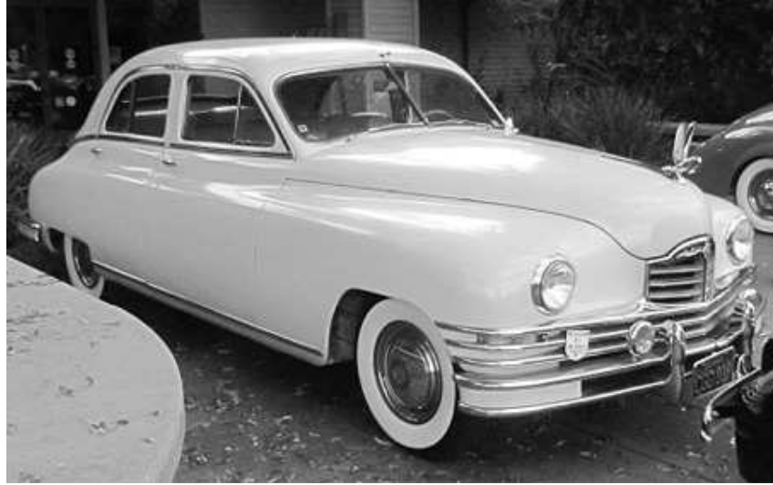
Clint Moore's '48 Deluxe Eight touring sedan.