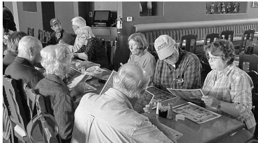
Part of the group at lunch.