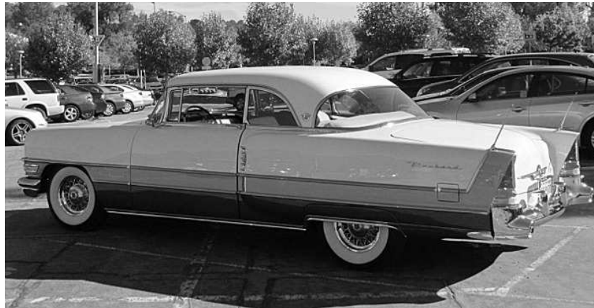
Fred & Pam Hills' '55 400.