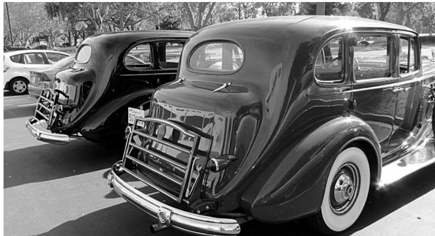
Interesting rear comparison of Beck's '37 Super Eight and Mihaly's '37 Twelve.