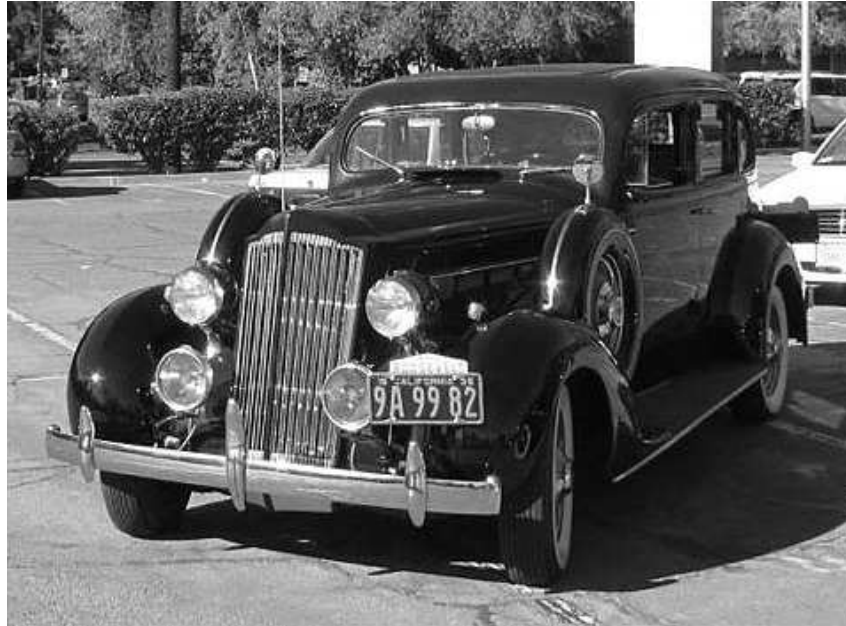
Paul Kraintz' 120 touring sedan.