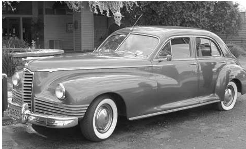
The Brazils' '47 2103 Super Clipper.