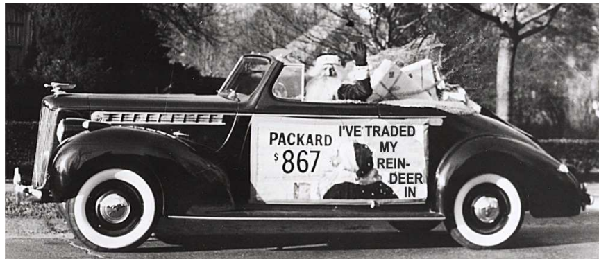
Even Santa drives a Packard.