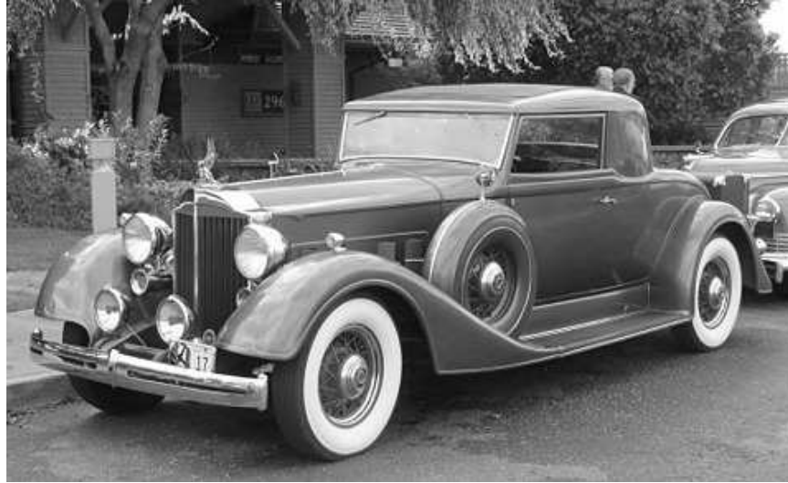
Milt Wheeler's '34 1101 rumble-seat coupe.