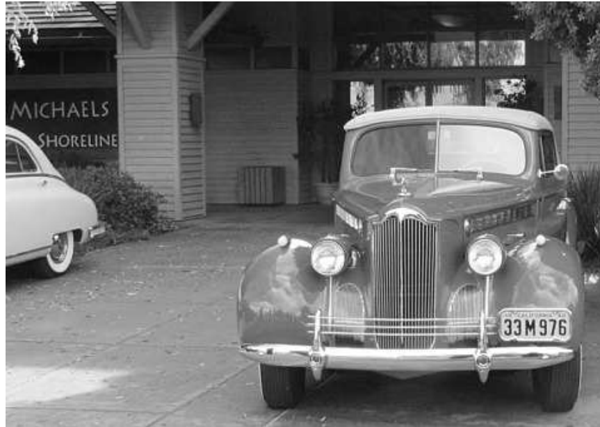
Tim & Kathie Toland's '40 110 convertible coupe.