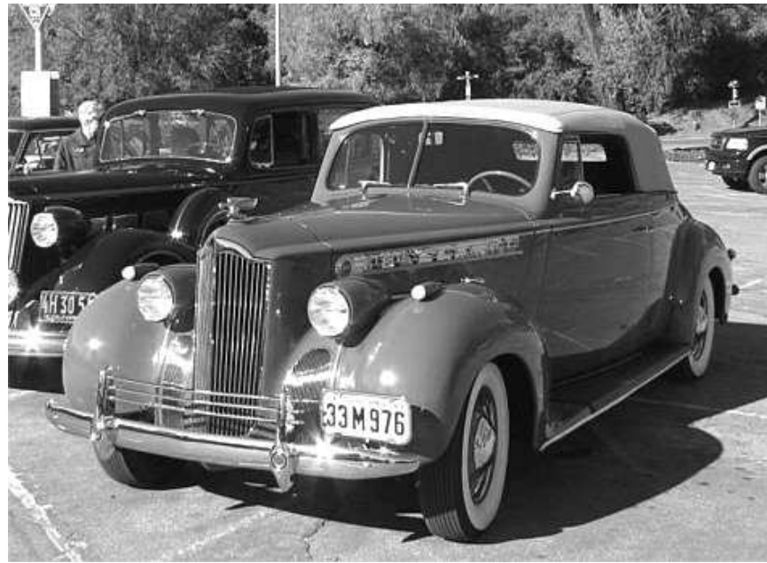
The Tolands' '40 110 convertible coupe.