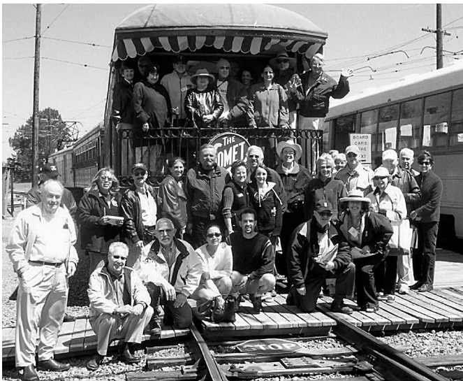
April 19: The Rio Vista Railroad Museum.