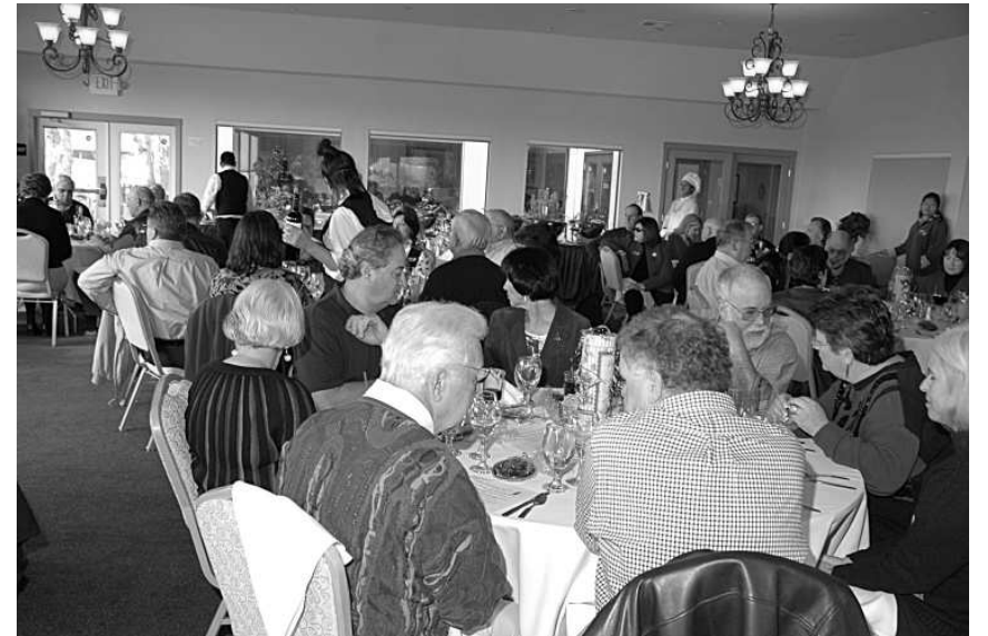
Dec. 7: The setting for the Holiday Banquet was a very nice dining room overlooking a yacht harbor. A fitting end to a great tour season.