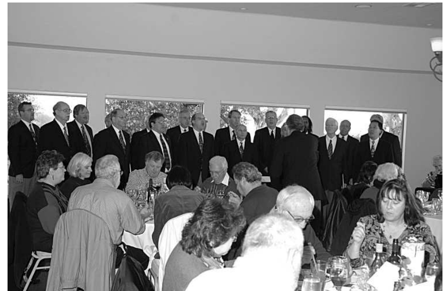
The Bay Area Men's Chorus.