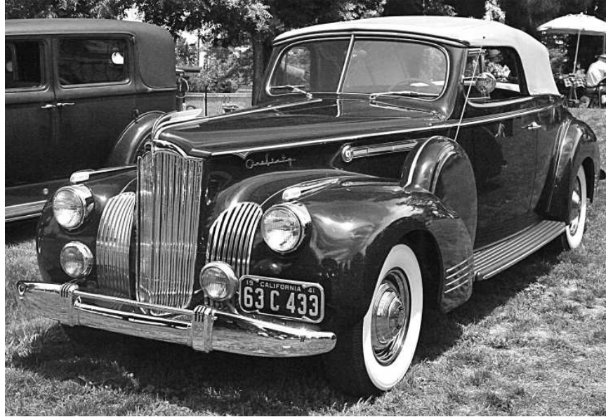
Milt & Carolee Wheelers' '41 160 convertible coupe.