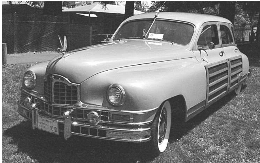
Blake Weston's '48 station sedan.