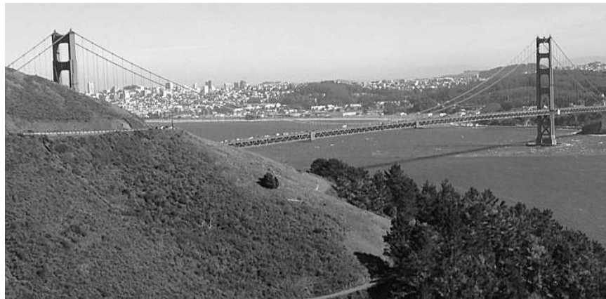
The view across the Golden Gate Bridge with San Francisco in the distance..