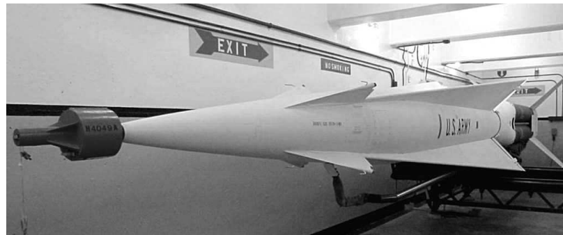
One of the Nike missiles in its bunker .