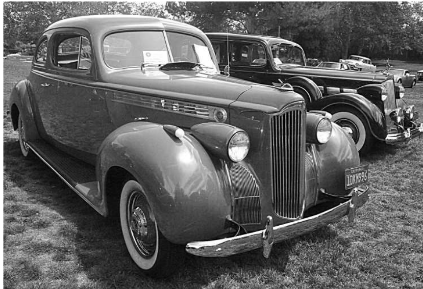
Rod Derbyshire's '40 1800 opera coupe.