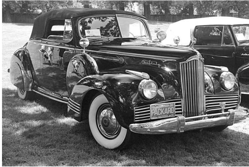
Lorraine Blackburn's '42 2006 convertible coupe.