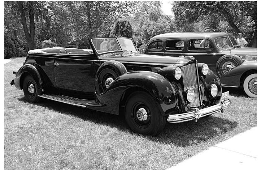
Unusual Packards always show up at a PAC National Meet as evidenced by this one-off custom Derham 1938 1608 Twelve convertible victoria.