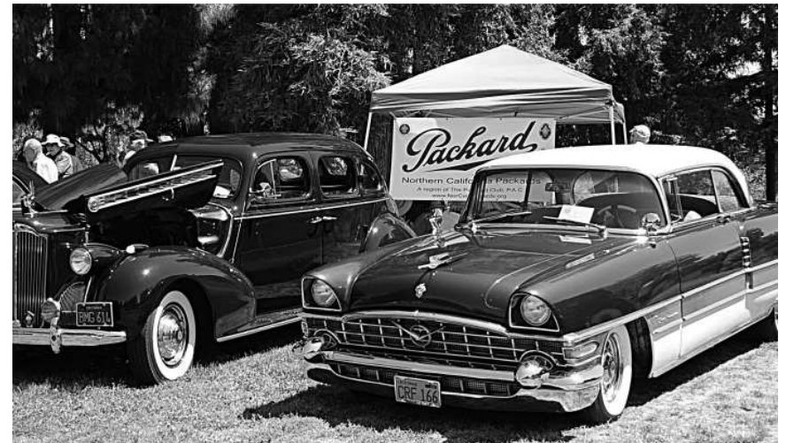
PORTAL PARK PICNIC WRITE-UP STARTS ON PAGE 4