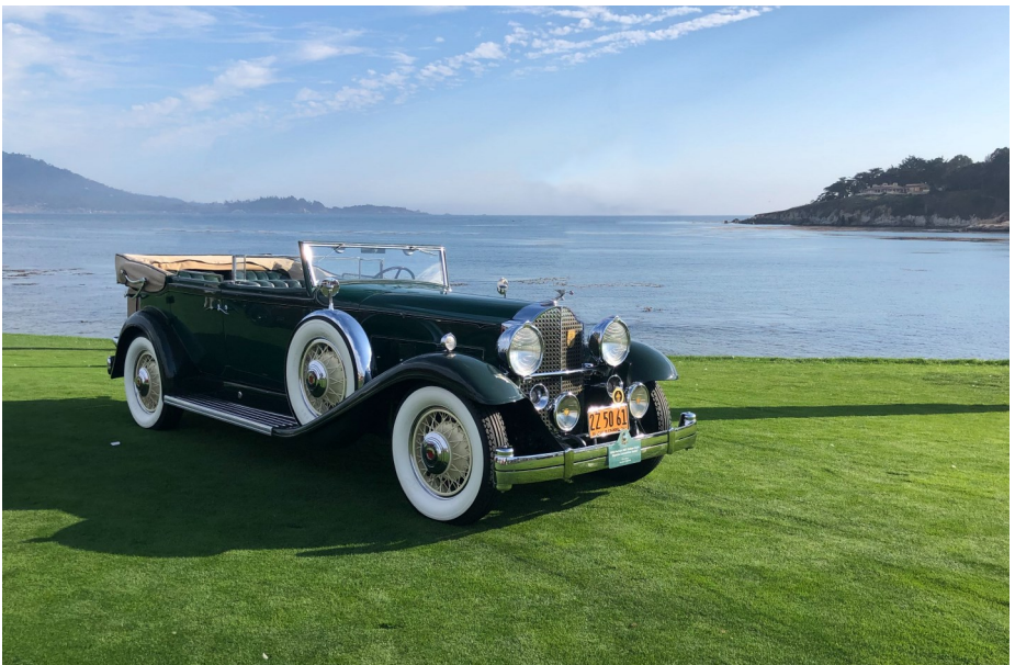
Obligatory waterfront glamour shot.