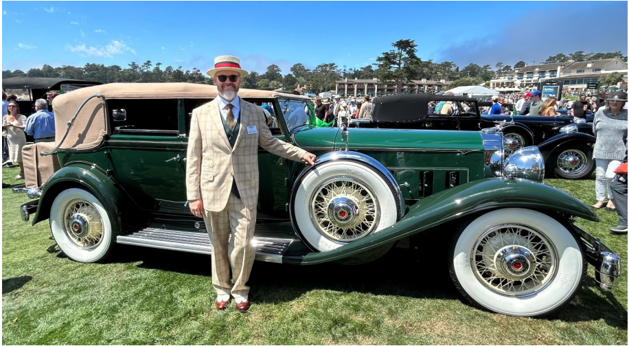
Beaming in my period outfit in front of “Marlene the Dietrich” at the Pebble Beach Concours d’Elegance.

It has been a lifelong goal of mine to take a car to Pebble Beach, and when I purchased “Marlene the Dietrich,” my 1932 903 Eight Deluxe Convertible Sedan, with its eye-catching two-tone green paint and movie car provenance, I hoped it would be my chance. After 7 years, 3 application attempts and 1 global pandemic, I finally got a coveted invitation.