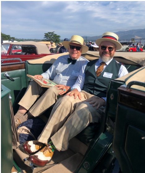
Relaxing with dad after we put the top down..

Sandra Button who handed us a gift and thanked us for coming, and then we were off again through a narrow path flanked by an audience gawking, applauding and snapping photos. We were assigned a golf cart to follow to our assigned spot where three field hosts guided us to place the wheels just so. At this point, I was able to take a bit of a breath because I wasn't being judged. Sure, we wiped down the car to give it a final