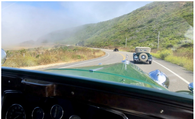
(Continued on page 12)