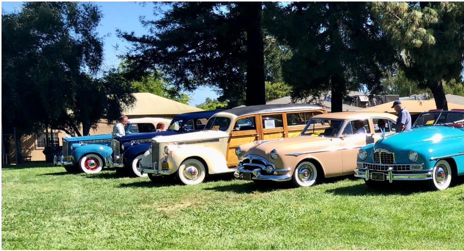
Packards at Portal Park: (l to r) Toland's 1940 110 Convertible, Higgins' 1940 Victoria, Moore's 1950 Super Deluxe Victoria, Heley's 1929 Deluxe