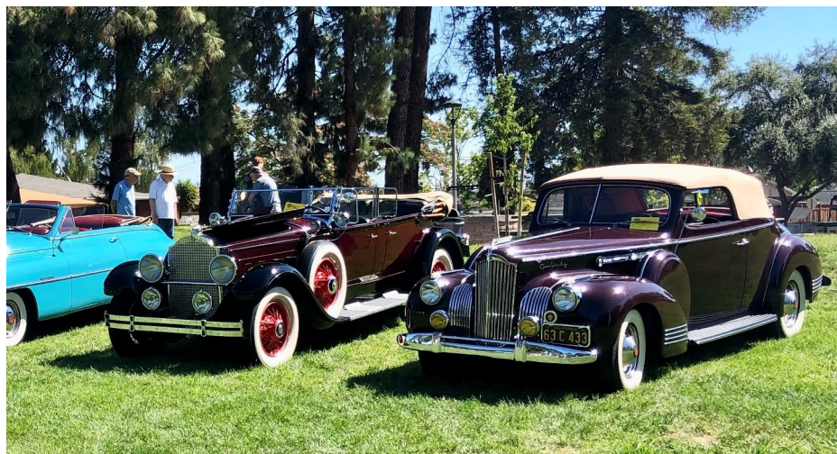
1940 110 Sedan, Cumming's 1940 110 Station Wagon, the Lubich Family 1953 Clip-Deluxe 8 Dietrich Phaeton and Wheeler's 1941 160 Convertible.