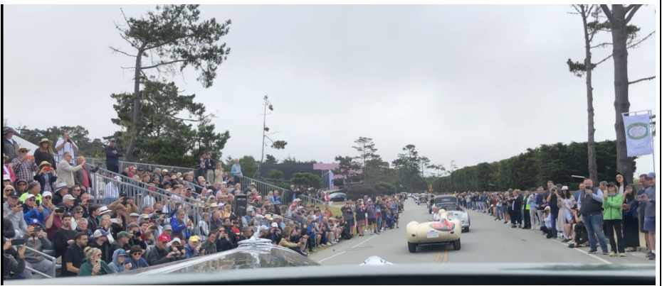
Crowds line the streets at the start of the Tour d'Elegance.

and road damage to deal with when we got back? All of these questions loomed loudly in my head. Fortunately, I had nothing to fear because the Packard performed flawlessly. After complementary donuts and one too many cups of coffee, we started our engines and slowly crept with the traffic toward the towering starting arch. As we rounded the corner onto Portola Road which was packed with cheering onlookers and passed the grandstand filled with beaming spectators, the spectacle of it all finally sank in on my bewildered sister, who stated, "This is like the Oscars of the car hobby!" To which I responded, "Duh!" The route wound its way out of Del Monte Forest, and we were finally on the open road – 30 beautiful miles of breathtaking coastline to Big Sur. All along the route were crowds of people and photographers precariously perched on cliffs and in trees trying to snap that elusive perfect picture of each passing vehicle. Because the route doubles back on itself to return to the starting point, we were afforded the opportunity to see most of the cars coming in the opposite direction, as if we were traveling a road 75 years in the past. Once across the finish line (checkered flag and all!), we were treated to an elegant lunch in the Mercedes/Maybach pop-up dealership and presented with a commemorative bag of keepsakes from the day. One event successfully down; one to go.