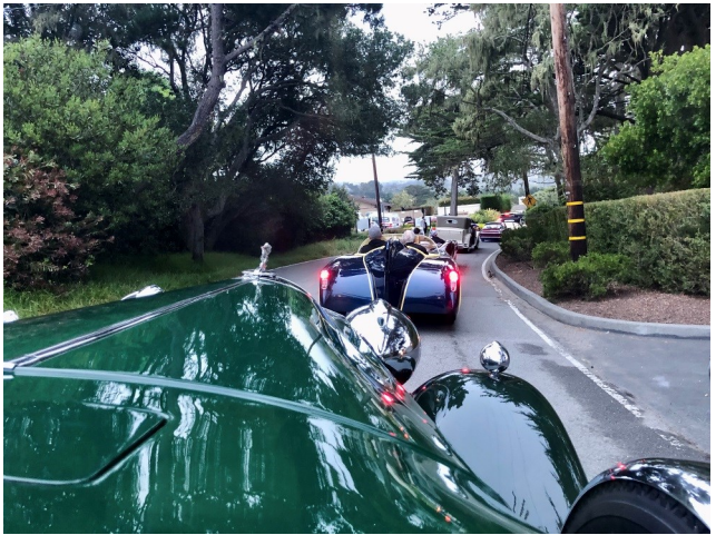
Traffic jam while waiting to take the field.