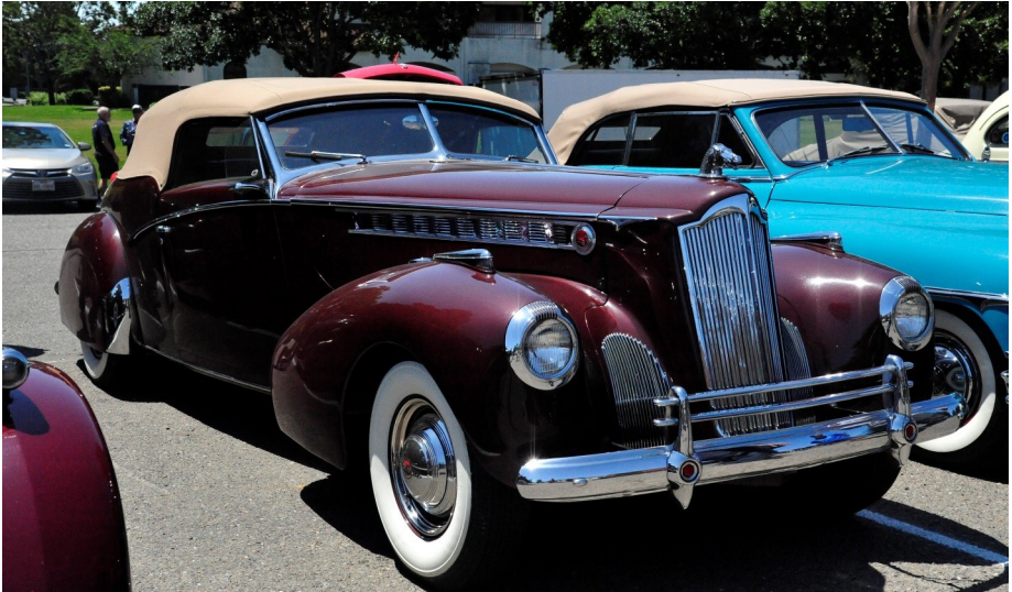
The 1940 180 Bohman & Schwartz Victoria, presumptive winner were there an award for longest hood, graces the parking lot at the DoubleTree host hotel.

Three extra years of planning, an army of volunteers and an outright gift from Mother Nature all contributed to making the 2023 National Meet a huge success. Originally slated for June 2020, the pandemic forced a postponement, however that also gave the planning committee the opportunity to hold the meet during the club's 70 th anniversary in the region where the club was founded. Countless people from the Nor Cal Region and beyond stepped up in every possible way to ensure the meet would go as smoothly as possible. And ultimately, we enjoyed a classic California "sunny and mild" week, with just a bit of heat touching the show day – but nothing even close to the 112° we experienced in 2003!