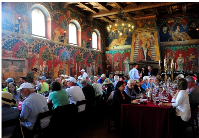
The Packard group wine tasting in the great hall of the Castillo di Amorosa.