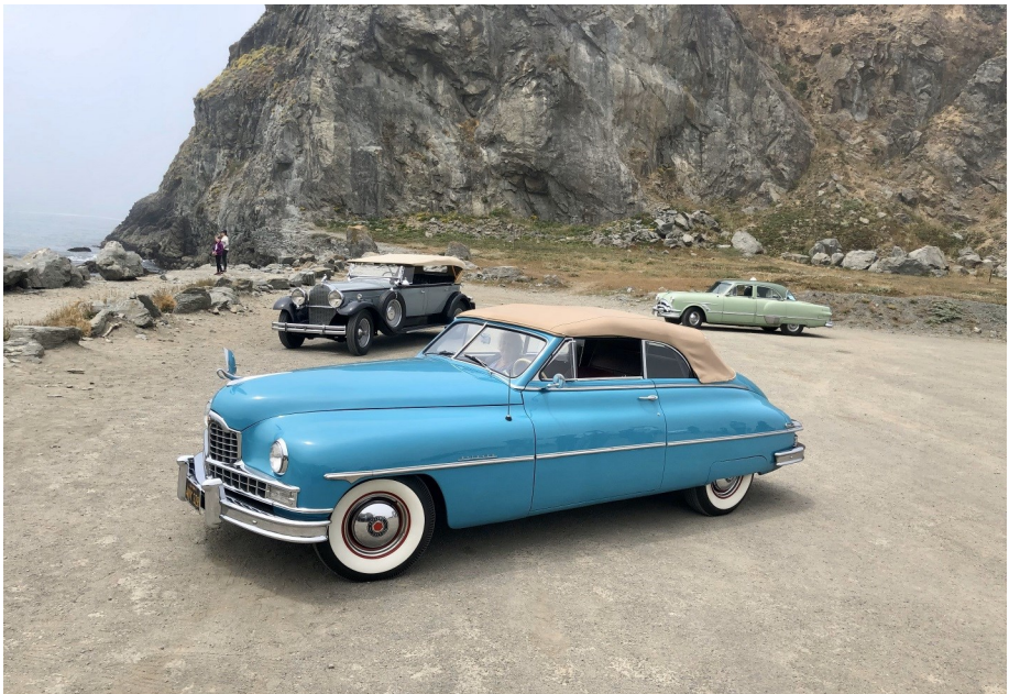
Below: Doug Moore's 1950 Super 8 Deluxe Victoria with a 1929 640 Custom 8 Phaeton and 1953 Cavalier Touring Sedan at Goat Rock.