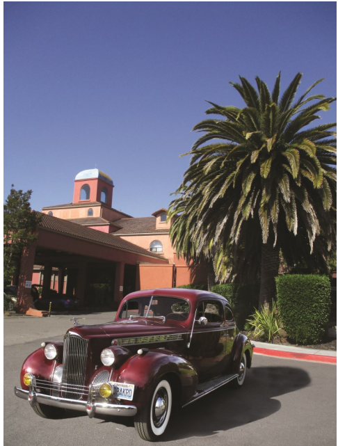
Silver Circle Member Greg Titus' 1940 120 Coupe parked at our host hotel.