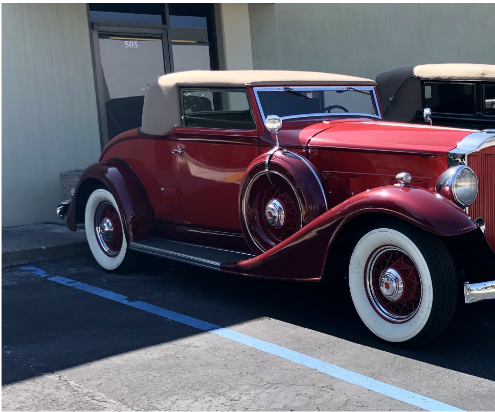
Outside the building that houses the Bertolotti Collection and Clint Moore's 1932 903 Eight Deluxe C