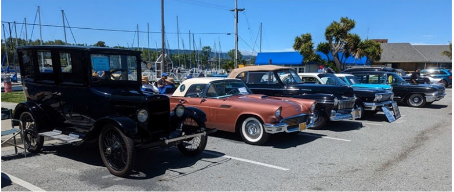
A photo from Friendship Day 2022 showing the variety of cars in attendance.

Join your friends from Nor Cal Packards as we participate in the 60th annual Friendship Day organized by the Mid-Peninsula Old Time Auto Club on Sunday May, 21. Arrive as early as 8am and stay through lunch! If turn out is anything like other similar events this year, it should be packed! This is a casual event for all Bay Area clubs, and there is sure to be a wide variety of cars.