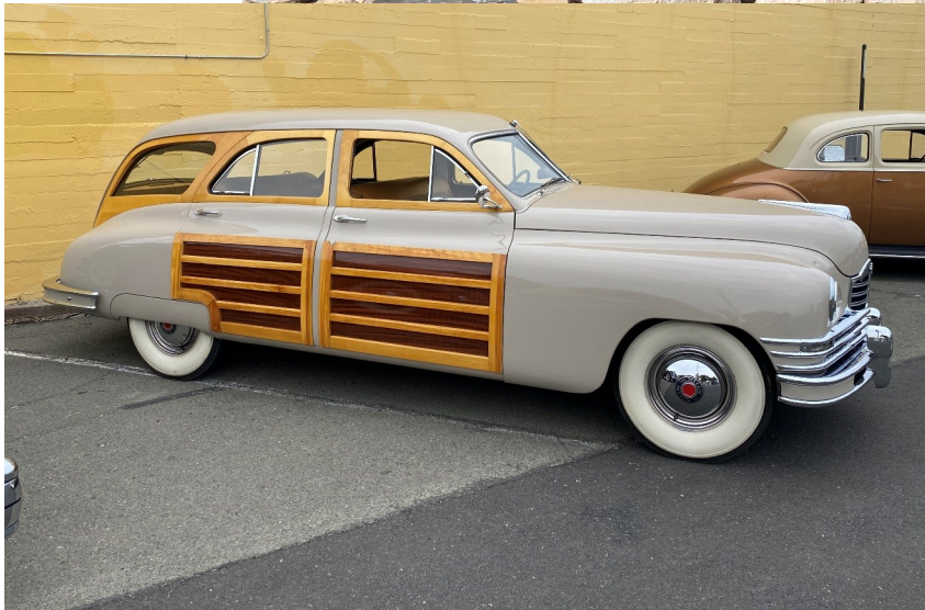
Left: Sandra & Em 1948 Station Seda meet.