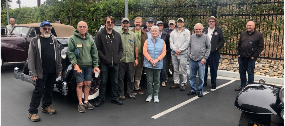
Above: The merry members of Nor Cal Packards in attendance.