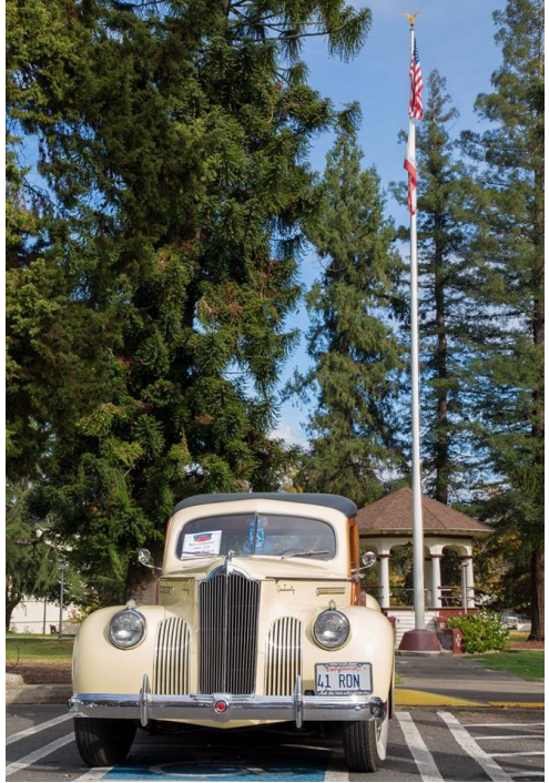
Ron Carpenter's former 1941 110 Station Wagon on display at the Veterans Home at an event in years past.

If you are interested in participating, contact Clint Moore immediately! The Veterans home takes COVID precautions very seriously. All attendees must have their vaccine and at least one booster, and vaccination cards must be submitted prior to arrival.