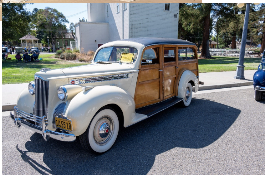
Cumming's 1940 Wagon at History