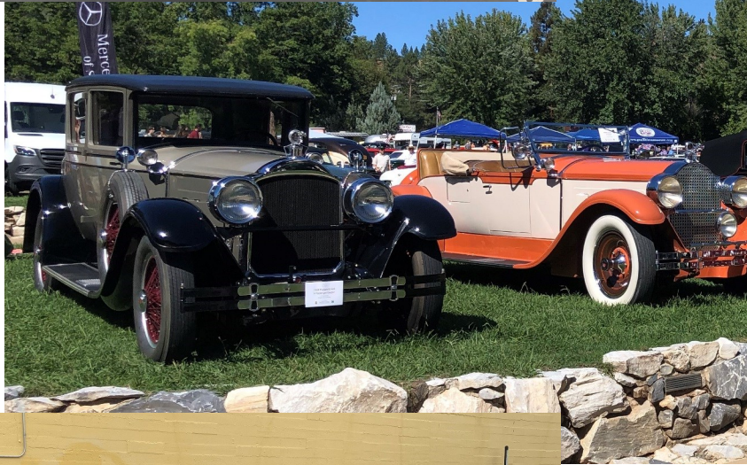
Above: A portion c class at Ironstone.