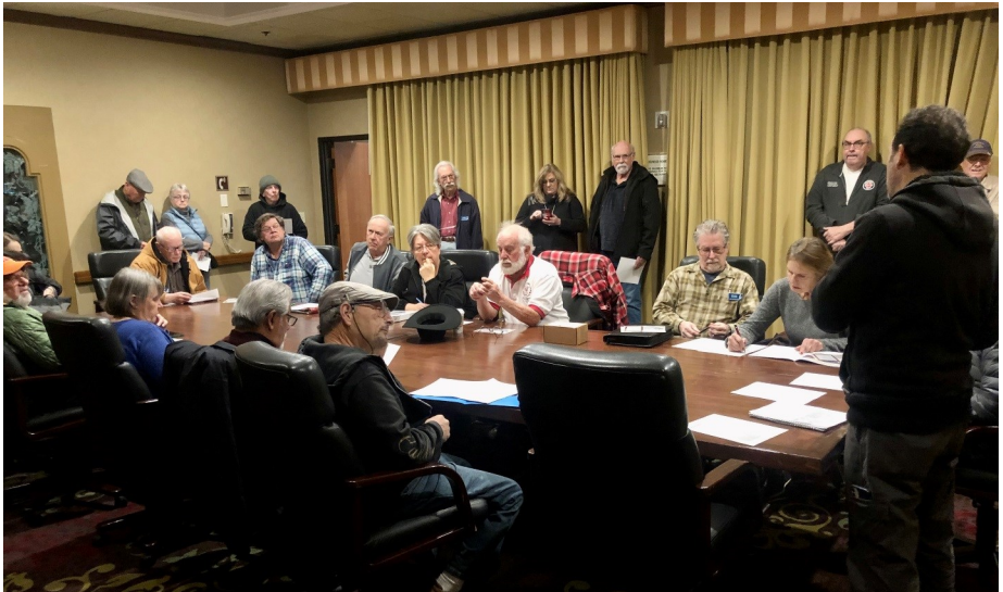
Initially it was standing room only at the volunteer event held at our host hotel on February 26!

The next edition of the Pious Pelican will be the final one before the meet. Look for those final details and if you have any questions before then, do not hesitate to call or email!!