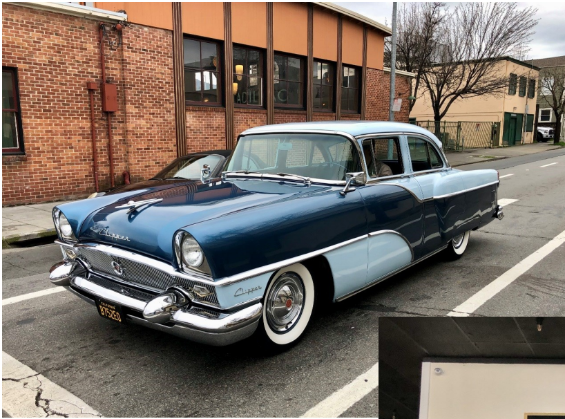
Above: Andy Sinclair's beautiful 1955 Clipper Super leaving San Rafael.