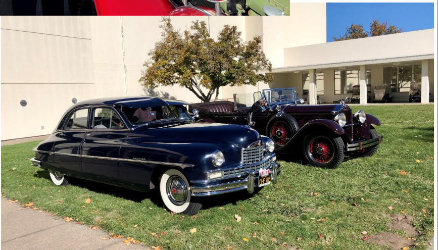
Below: Two of the five Packards displayed at the Veterans Home. Gerry Wuichet's 1950 Super Eight Deluxe Sedan and Rod Dahlgren's 1929 640 Custom 8 Touring.