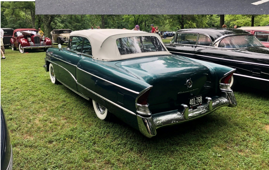
Left: A 1956 Chrysler Imperial tribute conversion was never produced