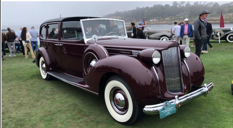
The First-in-Class winning 1938 1608 Twelve Rollston Town Car on the lawn at Pebble Beach Concours d'Elegance

Another fantastic Monterey Car Week is behind us with many Nor Cal Packard members having made the pilgrimage to spectate at or participate in the myriad events of the annual celebration. Whether you're interested in sports, economy, luxury, classic or exotic, there is something for everyone on the famous peninsula just 100 miles south of San Francisco.