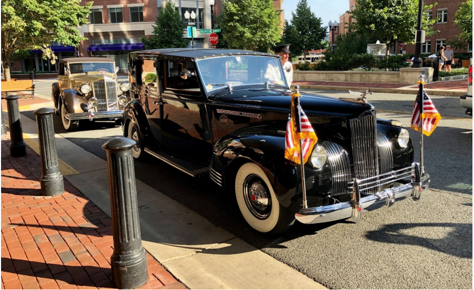
A very diplomatic 1941 120 Rollson Formal Town Car graces the curb in front of our host hotel, The Westin Alexandria Old Town.

For the first time since 2019, The Packard Club held its national meet on July 4-9, and it was a resounding success! Our nation's capital was the backdrop for a convergence of nearly 200 Packard enthusiasts from across the United States. Northern Californians were in no short supply either, as we had 7 members who made the trek. Packards in attendance ranged from 1930—1958, many of which were local cars, but one 1956 Patrician came all the way from Palm Springs, CA (after its trip to Western Regions in May)!