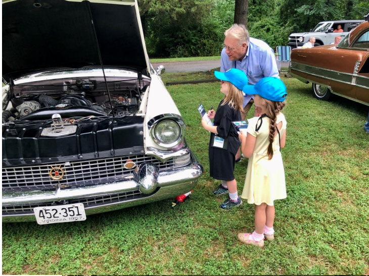
Left: PAC Past President assists the official Junior Judge in examining the 1957 Packard Clipper Sedan at the National Meet