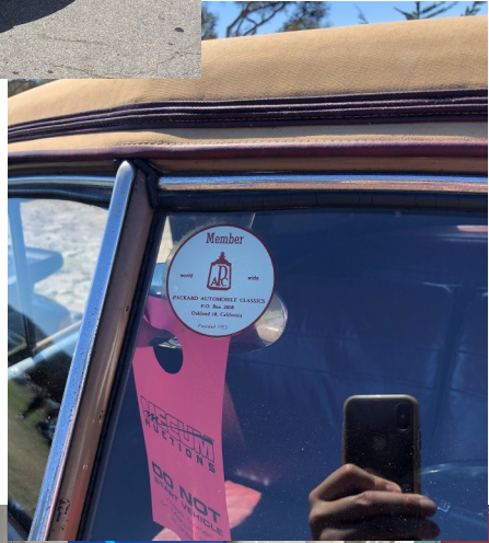
Below: One of the beautiful Packards at Gooding & Company was this 1932 905 Twin Six Coupe Roadster. It was expected to fetch $300,000-$400,000, but did not sell.