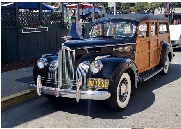
Left: The 1941 Station Wagon that supposedly was recently purchased from Brad Pitt, who needed the room in his new garage for a Tesla!