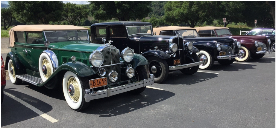
Clint Moore's 1932 903 Convertible Sedan at a past multi-make event that brought together an amazing display of Classics!

RSVP: by September 22 to Johnny Crowell 925-963-5835 or jcrow22006@aol.com