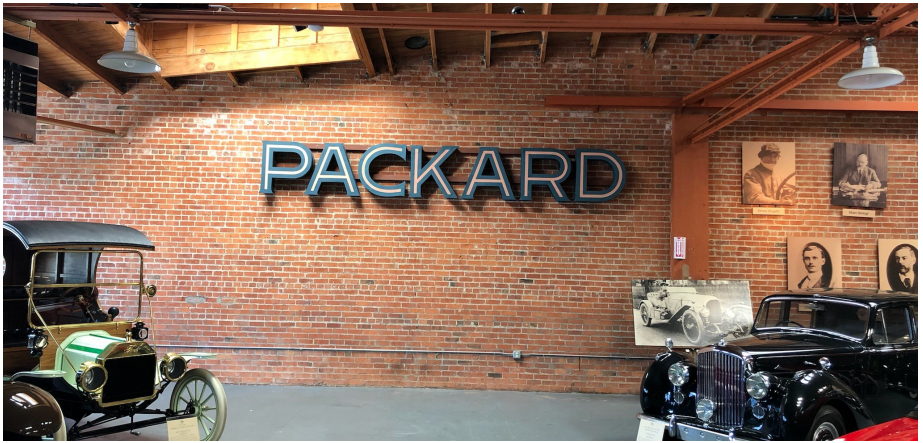
The original Packard sign to be relocated to the showroom at the Candy Store in Burlingame.

We will be joined by the membership of the Candy Store, who is generously providing light refreshments and finger food.