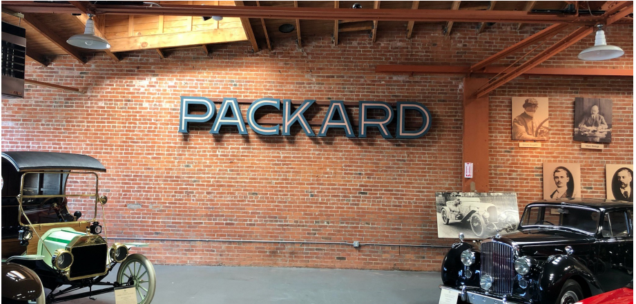
The original Packard sign to be relocated to the showroom at the Candy Store in Burlingame.