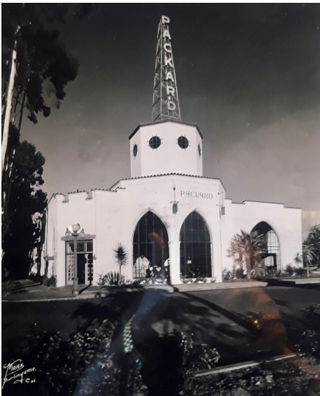
The Candy Store, shortly after it was built as the Packard dealer in 1928.

Mark your calendars for Sunday, March 13, as Nor Cal Packards has been invited to an afternoon of camaraderie and light refreshments at The Candy Store to commemorate the relocation of the original Packard sign back to a place of prominence in the showroom!