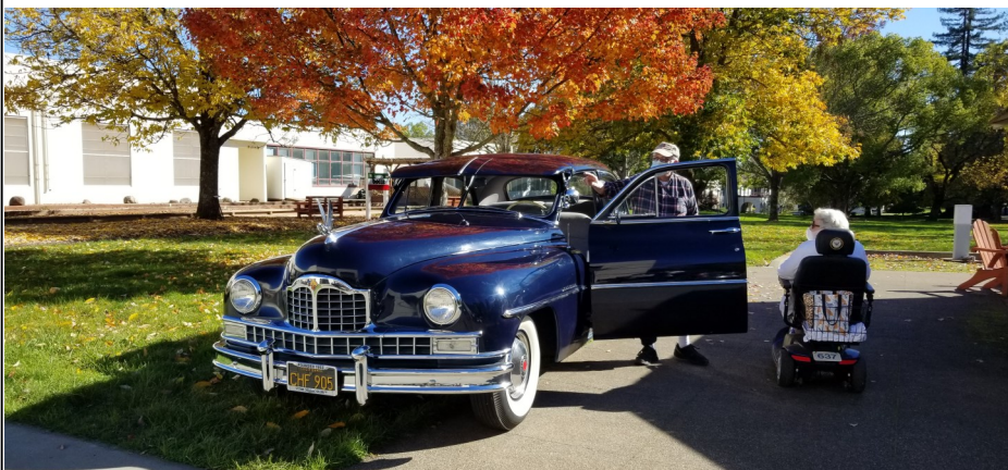
Below: One of our nation's heroes visits Jerry Wiuchet's 1950 Deluxe Super Eight Sedan beneath the beautiful fall colors.