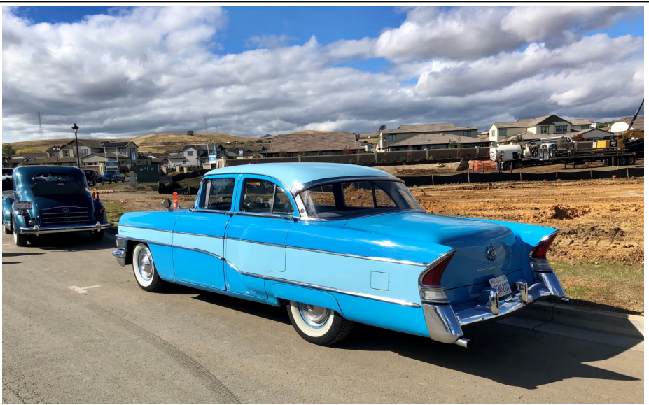
Above: Zane Buck's bright and cheery 1956 Clipper Super stood out on a spooky Halloween afternoon.