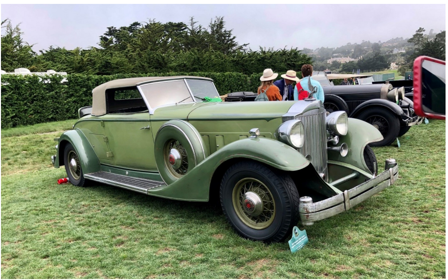
Above: Rumors of its existence proved true when the Mozart Collection debuted this 1933 Twelve Dietrich Convertible Runabout in the Prewar Preservation Class.