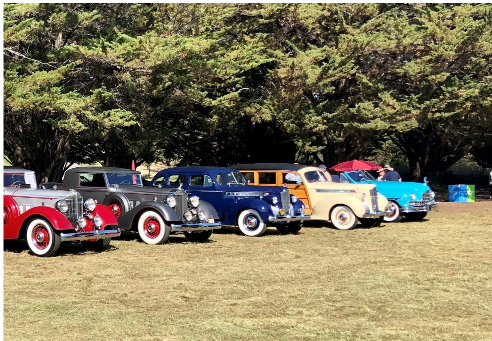
s 1940 110 Convertible Coupe, Carpenter's 1941 120 Station Wagon, Beidleman's Sedan, Cumming's 1940 110 Station Wagon, Moore's 1950 Super 8 Victoria,