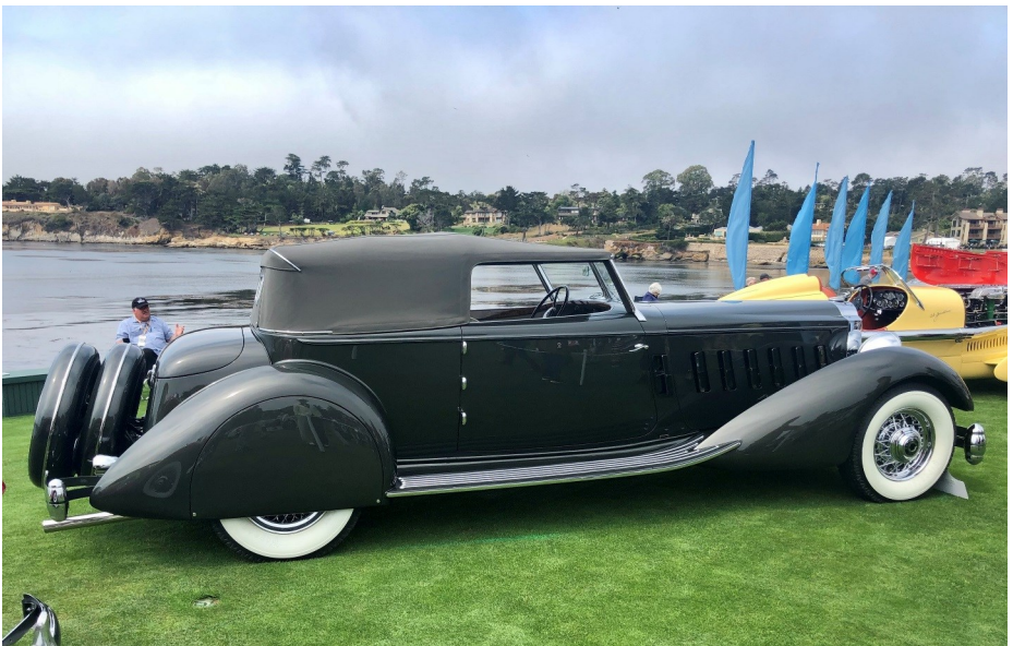
Who could forget the seemingly mile-long hood and green cloisonné of the 1934 1108 Twelve Dietrich Victoria that took Best in Show at Pebble Beach in 2013?