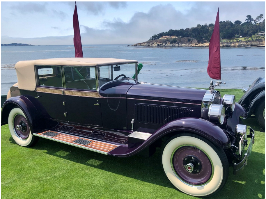
Below: Another previous Best in Show winner, this Murphy bodied lavender 1927 343 Eight Convertible Sedan took the top spot in 1977.