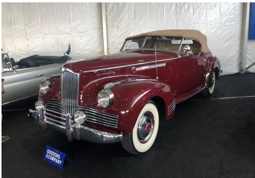
A stunning 1942 Darrin Custom Super Eight 180 Victoria was among the Packards available at the Gooding Auction during Monterey Car Week.