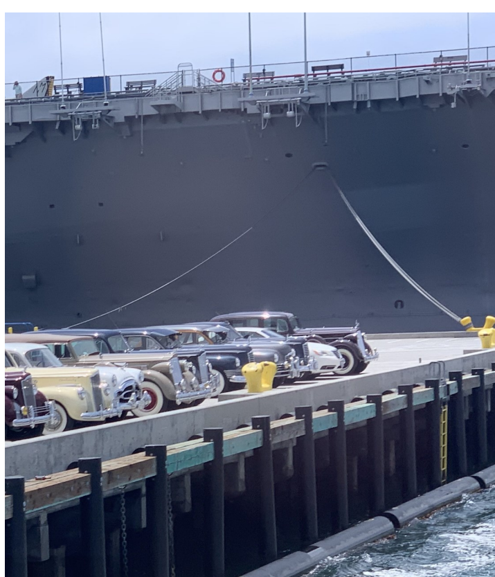
Below: Primo Packard Parking at the San Diego Automotive Museum. Left to right: 1936 1400 Eight Sedan, 1934 1100 Eight Sedan, 1941 One Sixty Touring Sedan, 1941 One Eighty LeBaron Sport Brougham, 1947 Clipper Super Sedan