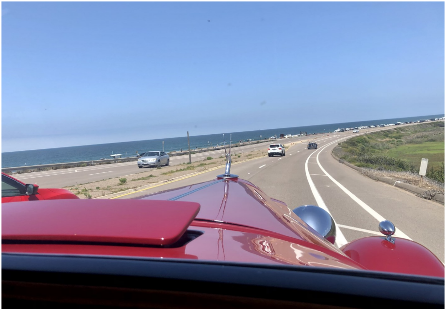
Below: Touring the Pacific Coast Highway between La Jolla and Del Mar in the 1934 1101 Eight Dietrich Convertible Sedan.