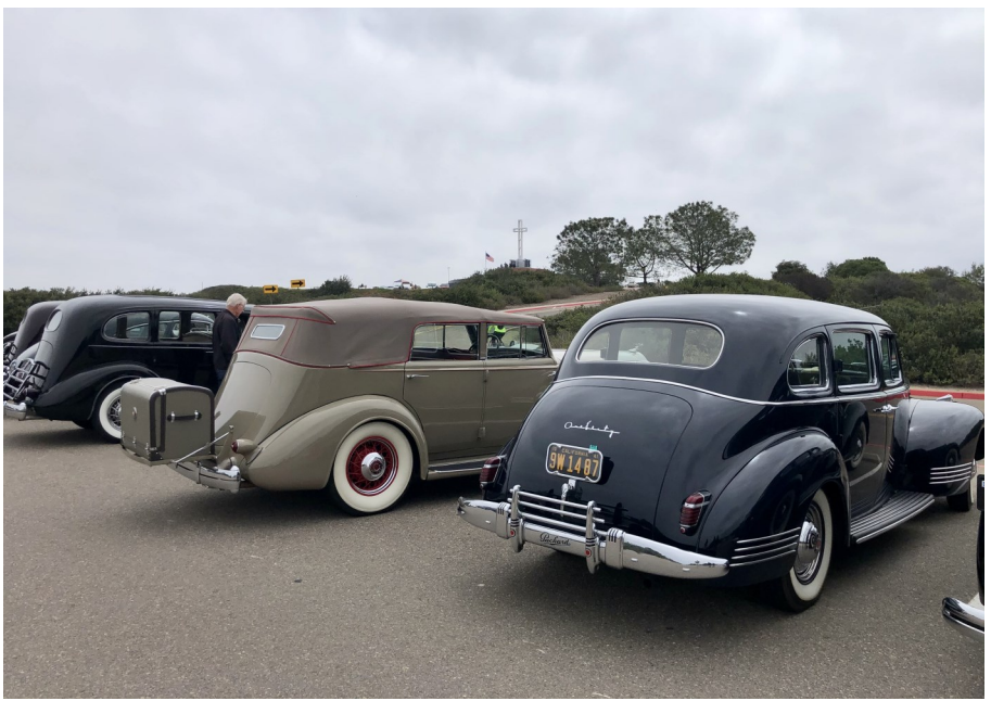
Above: 1936 1408 Twelve Dietrich Convertible Sedan and 1941 One Sixty Touring Sedan with the Soledad Mountain Cross memorial in the distance.