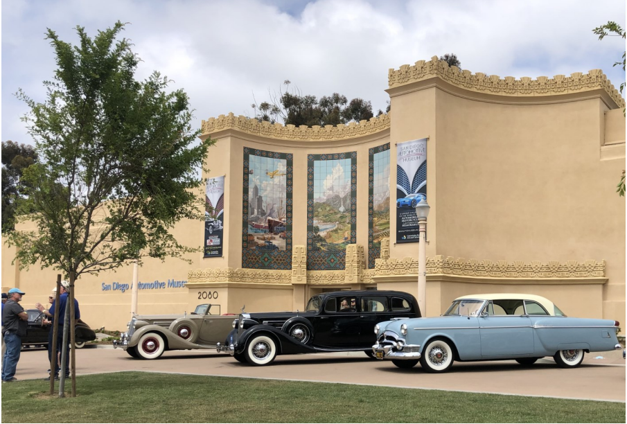
Packards at the San Diego Automotive Museum. Left to right: 1936 1408 Twelve Dietrich Convertible Sedan, 1935 1208 Twelve Limousine, 1954 Panama Hardtop.

After a year of canceled events and uncertainty, we finally had a chance to do something with cars. In. Real. Life! Our friends in the San Diego region hosted a wonderfully coordinated and planned event that, with 20 Packards and more than 50 people in attendance, made us all feel almost normal again. When we arrived at the host hotel Wednesday, each participant was greeted with a bountiful basket of snacks, keepsakes, and event information. The hotel itself was the Best Western Island Palms Shelter Island, an establishment well known in the area for its Midcentury Modern tiki-style main buildings, which made the arriving Packards really stand out!