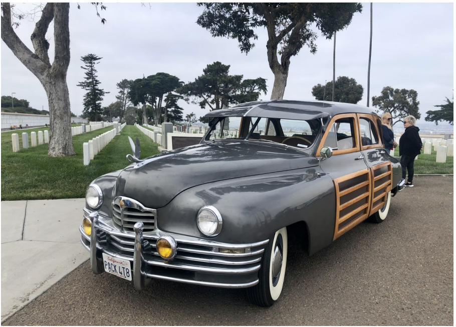
Above: Marjo Miller's amazing unrestored 1948 Eight Station Sedan.